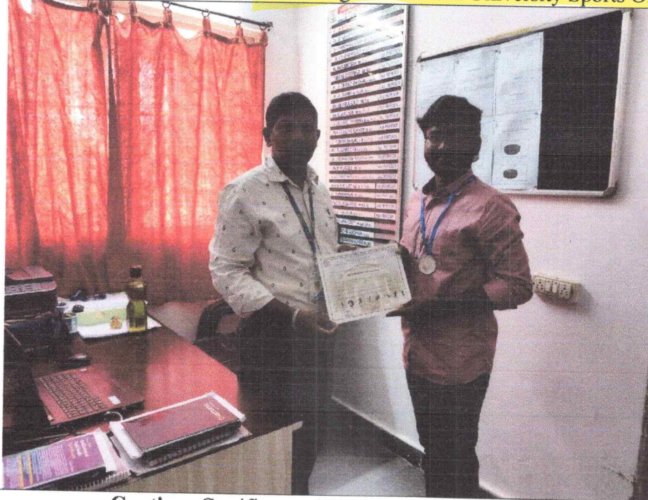
Caption: Certificate of The Participated Student